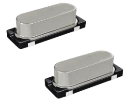
Image shown is a representation only. Exact specifications should be obtained from the product dimension.