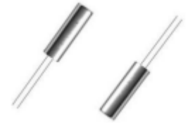
Image shown is a representation only. Exact specifications should be obtained from the product dimension.