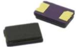
Image shown is a representation only. Exact specifications should be obtained from the product dimension.