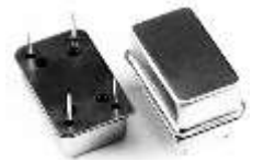
Image shown is a representation only. Exact specifications should be obtained from the product dimension.