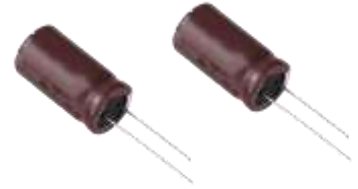
Image shown is a representation only. Exact specifications should be obtained from the product dimension.