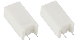
Image shown is a representation only. Exact specifications should be obtained from the product dimension.

A Cement Resistor Is A Heat- And Flame-Resistant Power Resistor. A Cement Resistor Can Handle The Large Amounts Of Power Flowing Through It And Is Not Damaged By Heat Or Flame. If You Are Designing A Circuit With A Large Amount Of Current Flowing Through The Resistor And It Needs To Be Resistant To Heat And Flame, Then A Cement Resistor Is A Good Design Choice. Cement Resistors Are Made Of Resistance Wire Wound On An Alkali-free Ceramic Core, Plus A Layer Of Heat-resistant, Moisture-resistant And Non-corrosive Protective Materials. The Wire Wound Resistors Are Then Placed In Square Ceramic Packages Sealed With Special Non-flammable And Heat-resistant Cement.