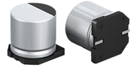
Image shown is a representation only. Exact specifications should be obtained from the product dimension.