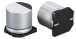
Image shown is a representation only. Exact specifications should be obtained from the product dimension.